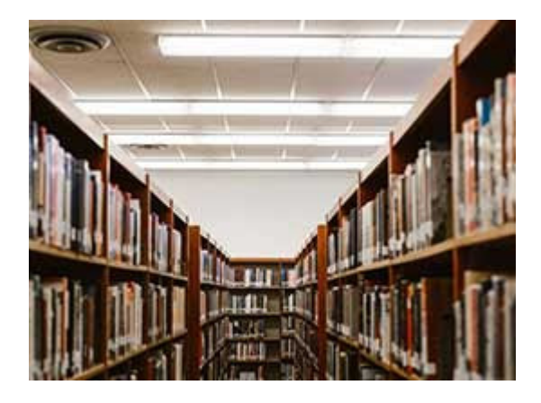
The deadline to apply for Unifor scholarships is June 9! Each year, scholarships are awarded to children of Unifor members in good standing.